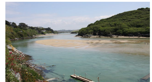
Images: 1. Fisral Beach, 2. Newquay Harbour 3. Rick Stein Fisral, image source: www.rickstein.com 4. River Gannel Estuary