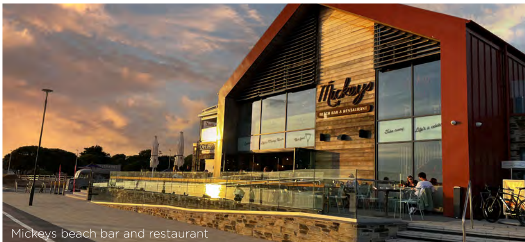
Mickey's beach bar and restaurant