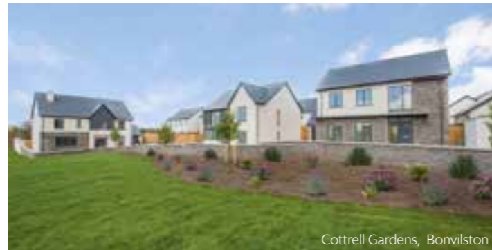
Cottrell Gardens, Bonvilston