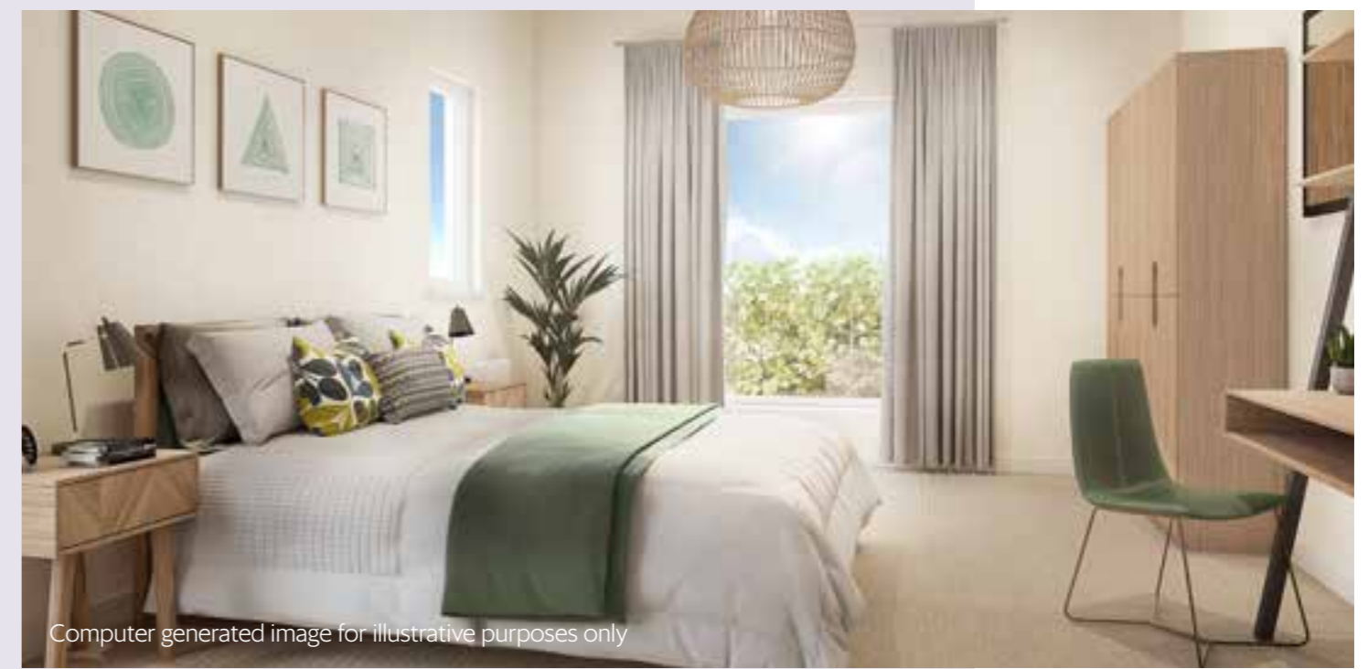
Computer generated image for illustrative purposes only