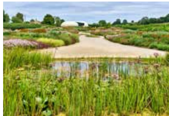
Hauser &amp; Wirth