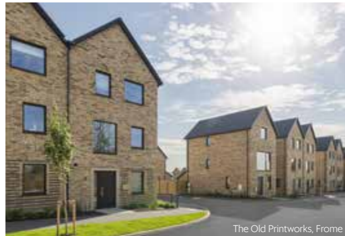
The Old Printworks, Frome