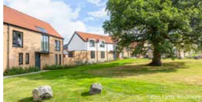
Cross Farm, Wedmore