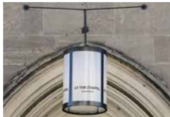
At The Chapel