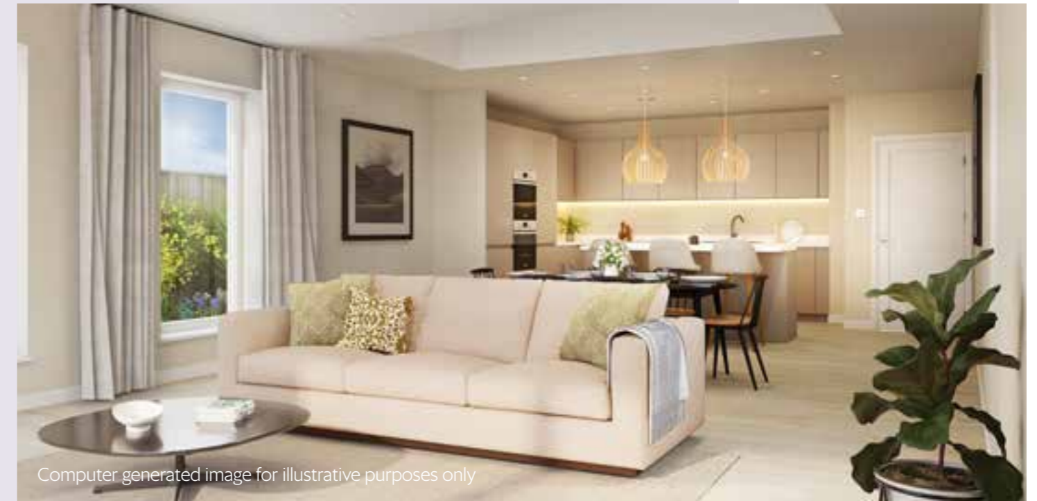
Computer generated image for illustrative purposes only