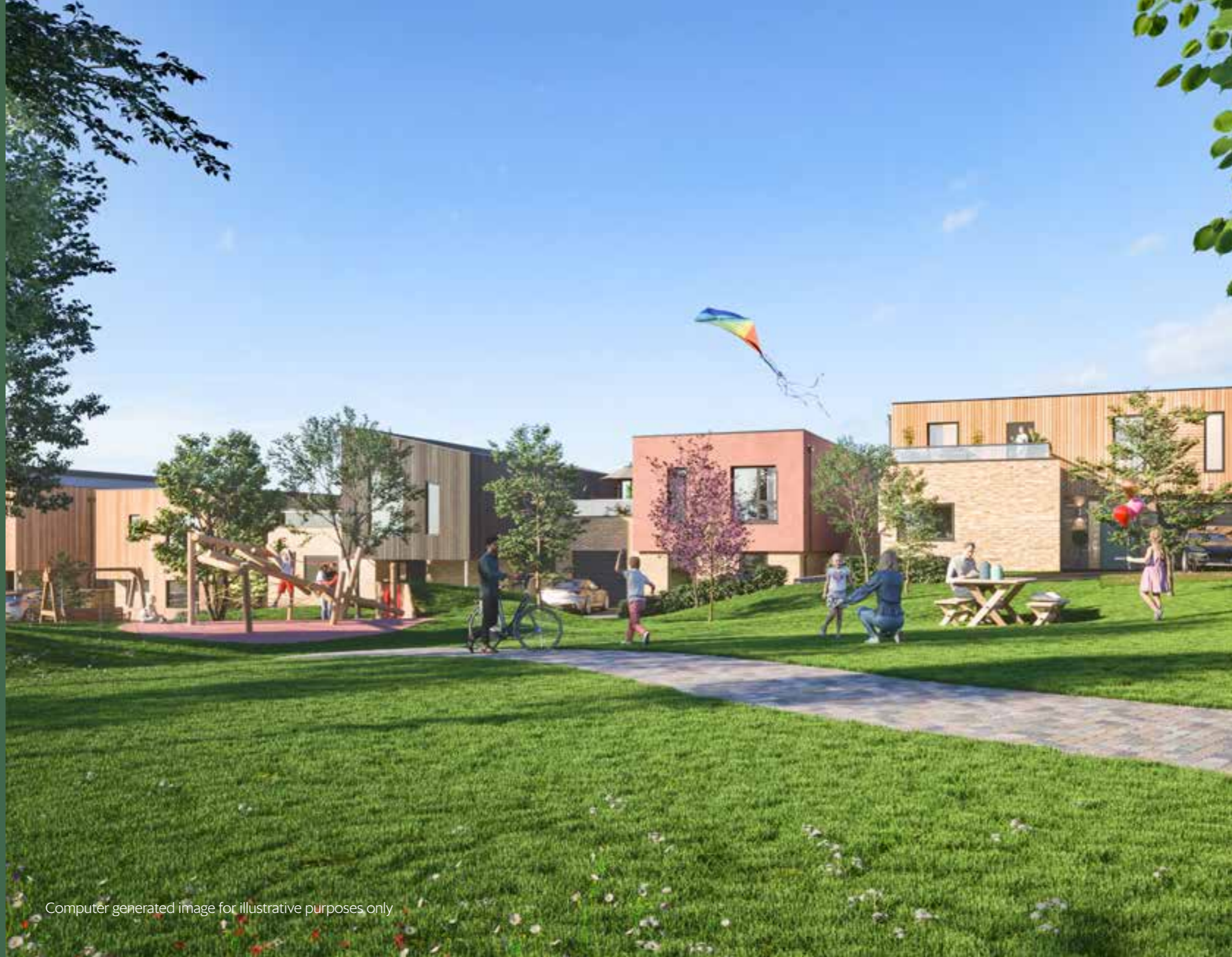
Computer generated image for illustrative purposes only

We believe a focus on sustainability and wellbeing should be at the absolute forefront of everything we do.