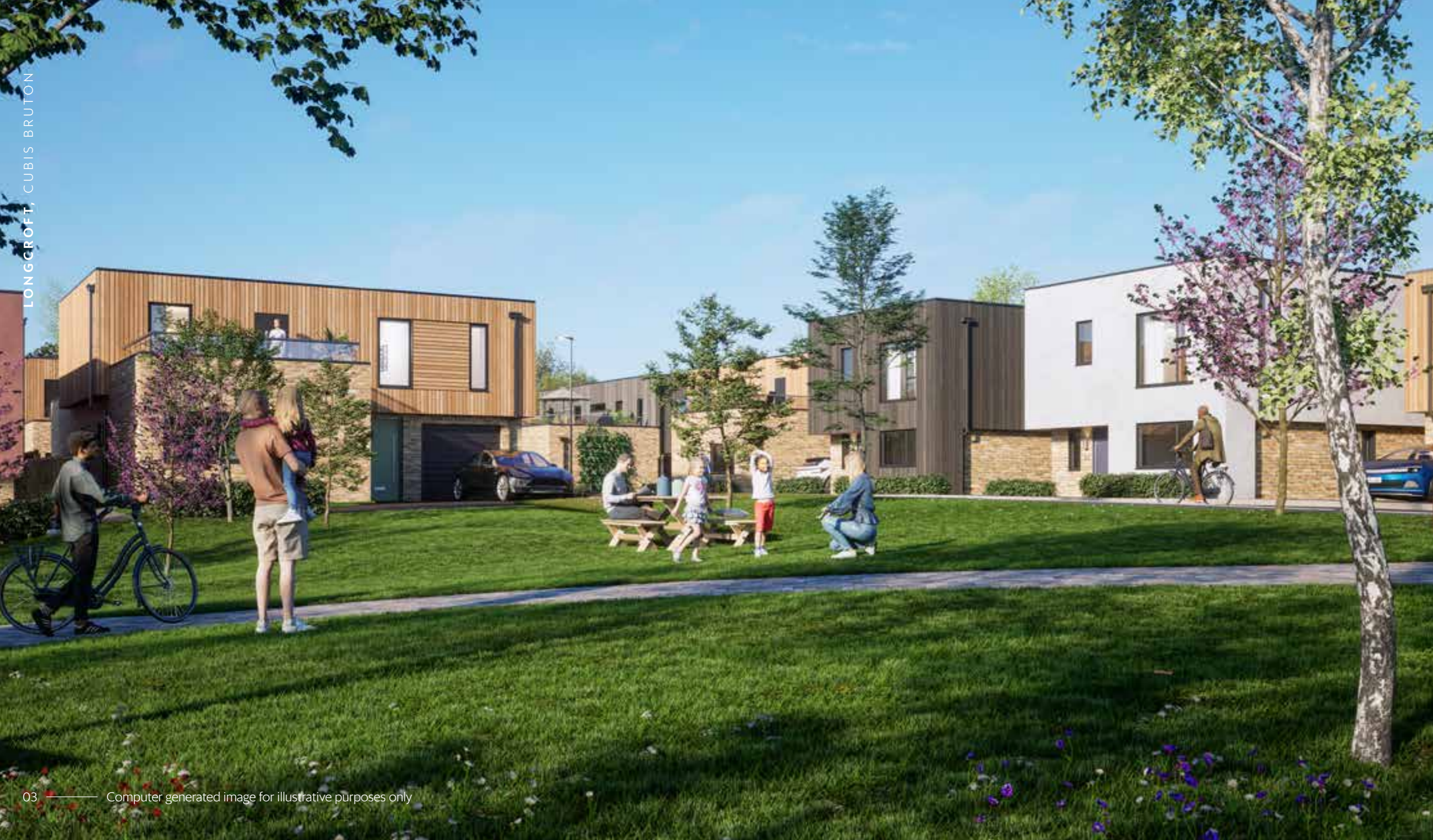
03 Computer generated image for illustrative purposes only