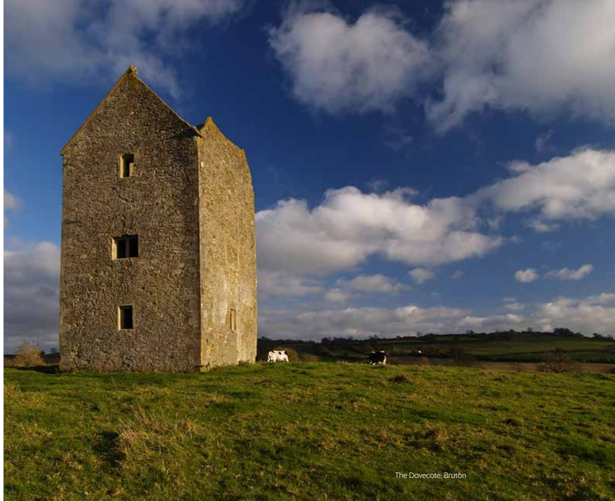
The Dovecote, Bruton

Bruton is a small Somerset town situated in the south west of England, known for its beautiful and verdant countryside and charming lifestyle.