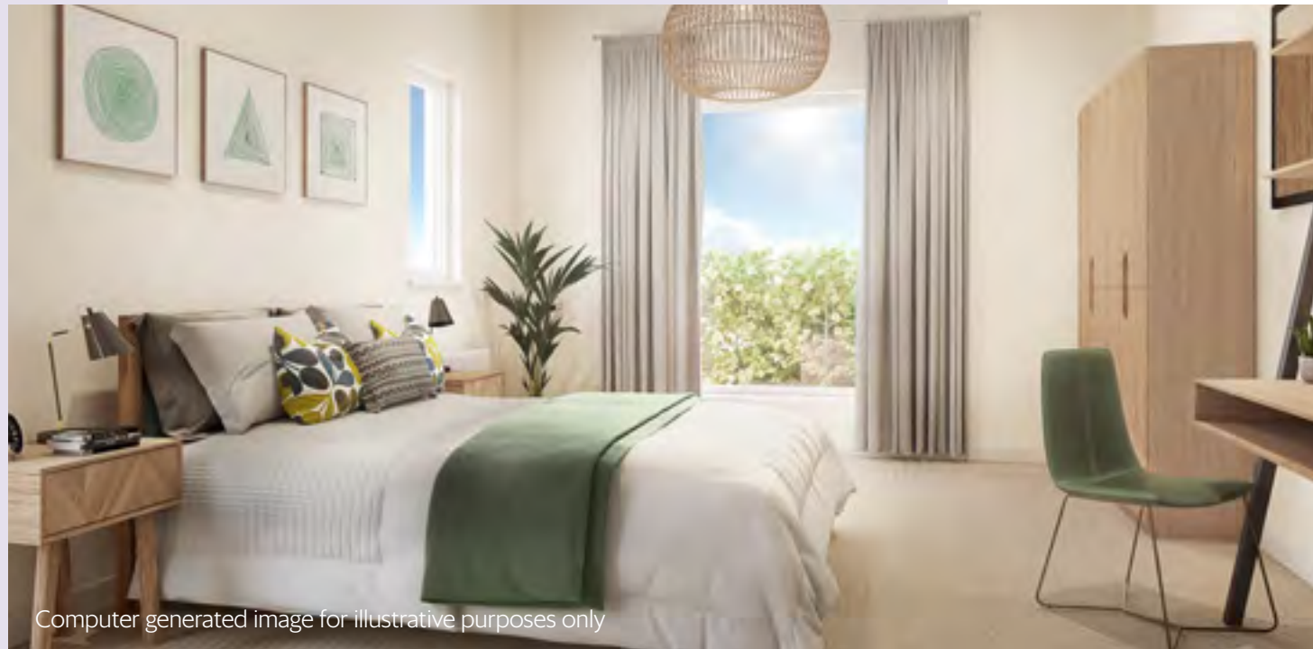
Computer generated image for illustrative purposes only