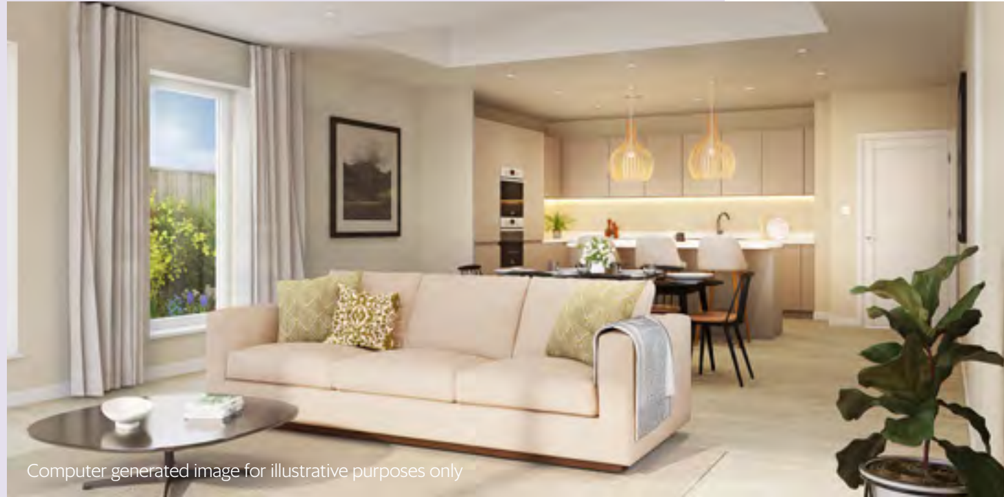
Computer generated image for illustrative purposes only