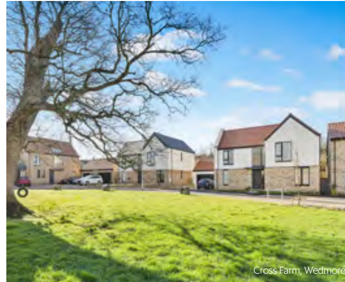
Cross Farm, Wedmore