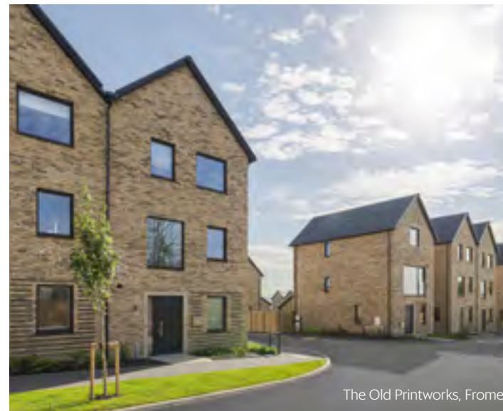
The Old Printworks, Frome