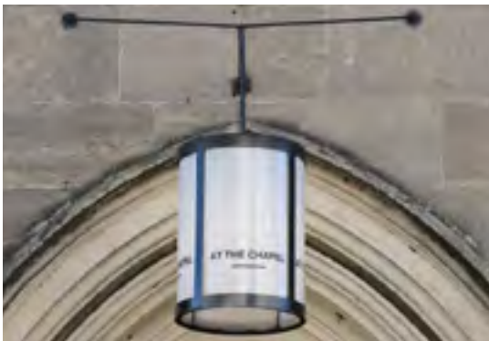
At The Chapel