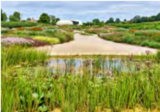
Hauser & Wirth