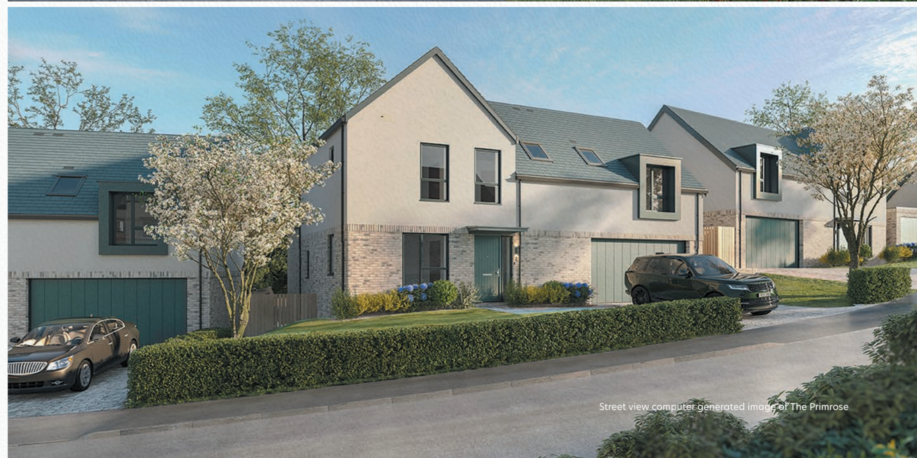
Street view computer generated image of The Primrose