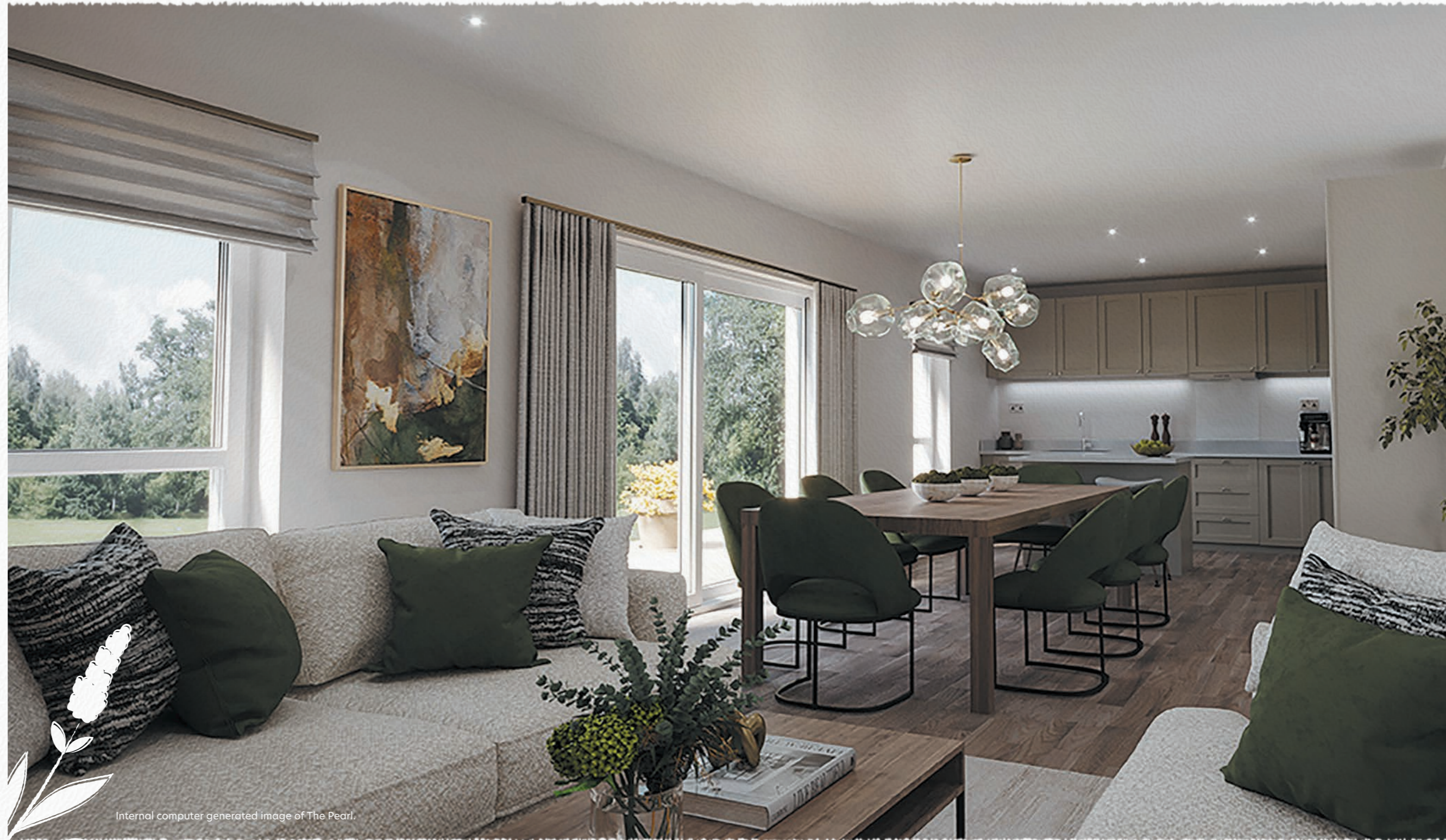
Internal computer generated image of The Pearl.

The front of each home offers convenient parking with a garage and additional off-street parking.