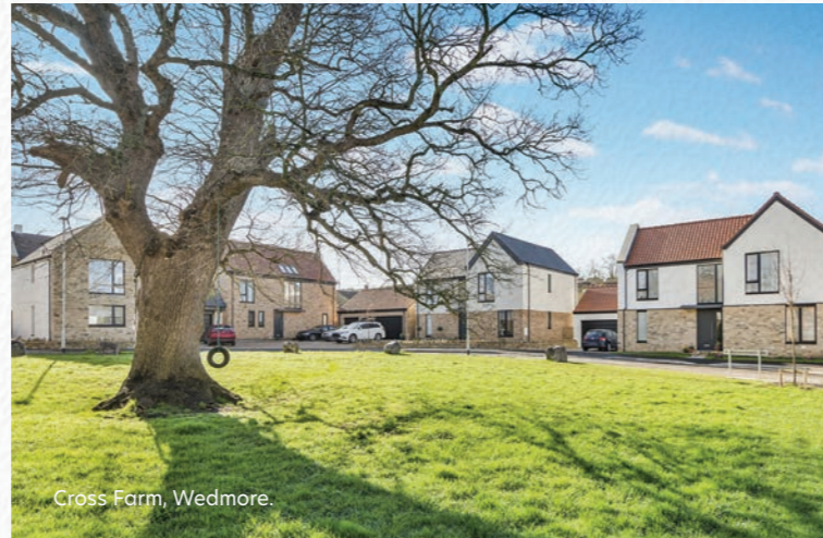
Cross Farm, Wedmore.

Previous developments by Acorn Property Group