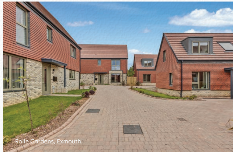
Rolle Gardens, Exmouth.