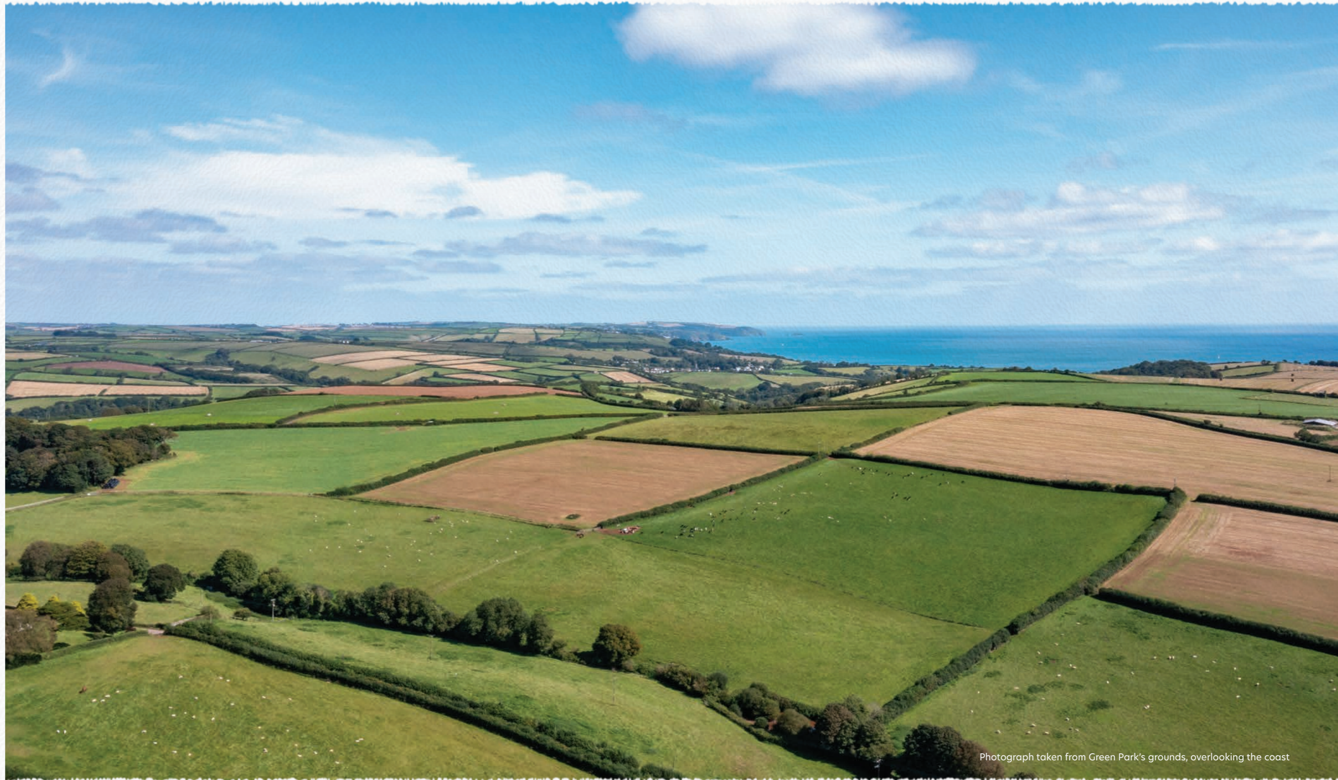
Photograph taken from Green Park's grounds, overlooking the coast

In every direction, the countryside beckons, offering endless opportunities for discovery. From tranquil strolls through rolling fields to exhilarating adventures in the heart of nature, Green Park is your gateway to the boundless wonders of the countryside.