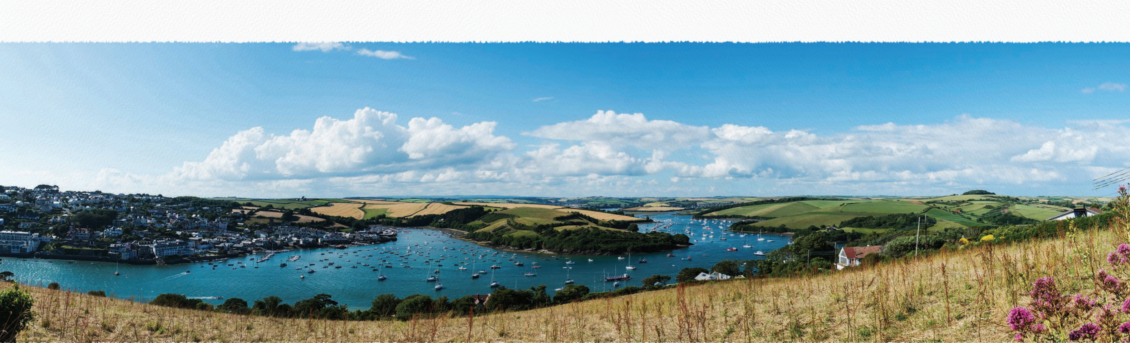
Salcombe and East Portlemouth