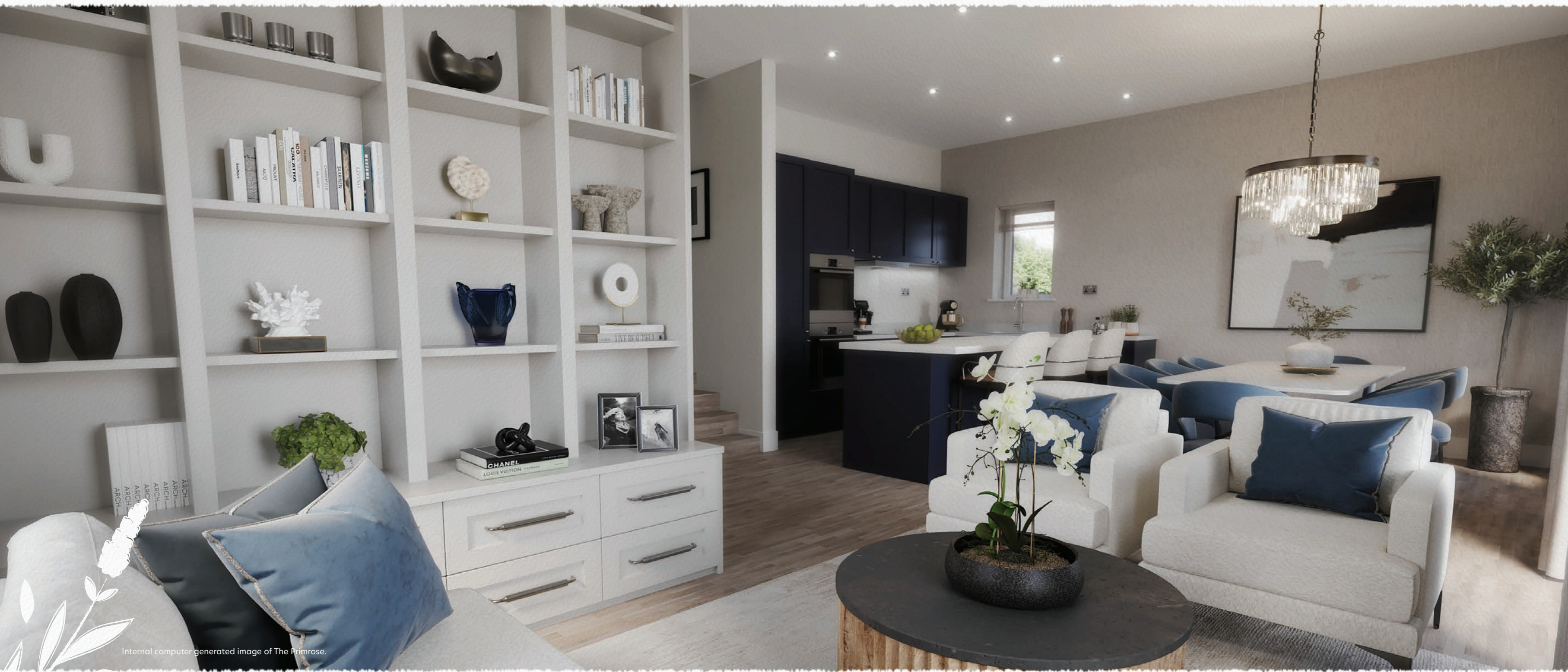
Internal computer generated image of The Primrose.