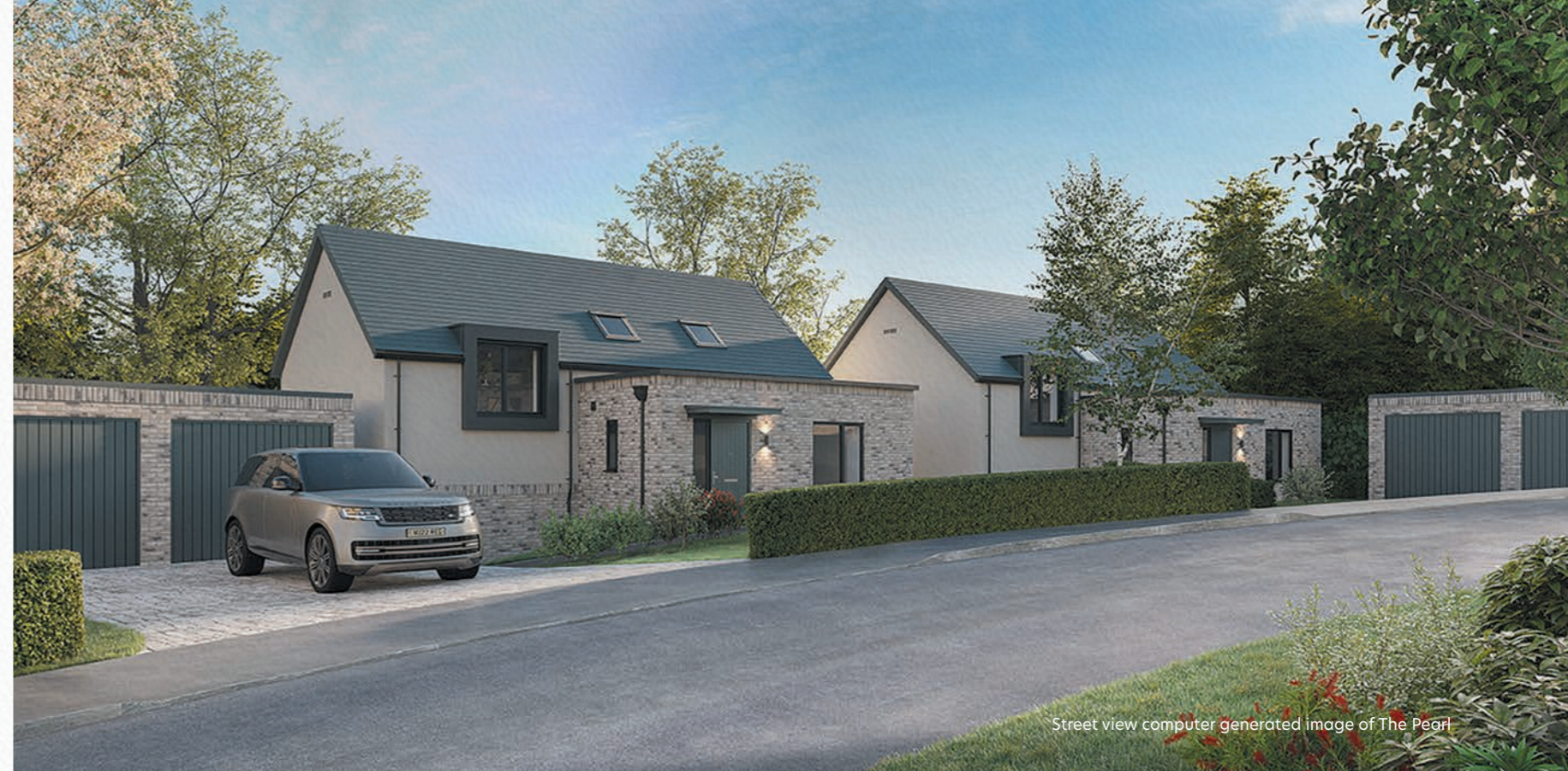
Street view computer generated image of The Pearl