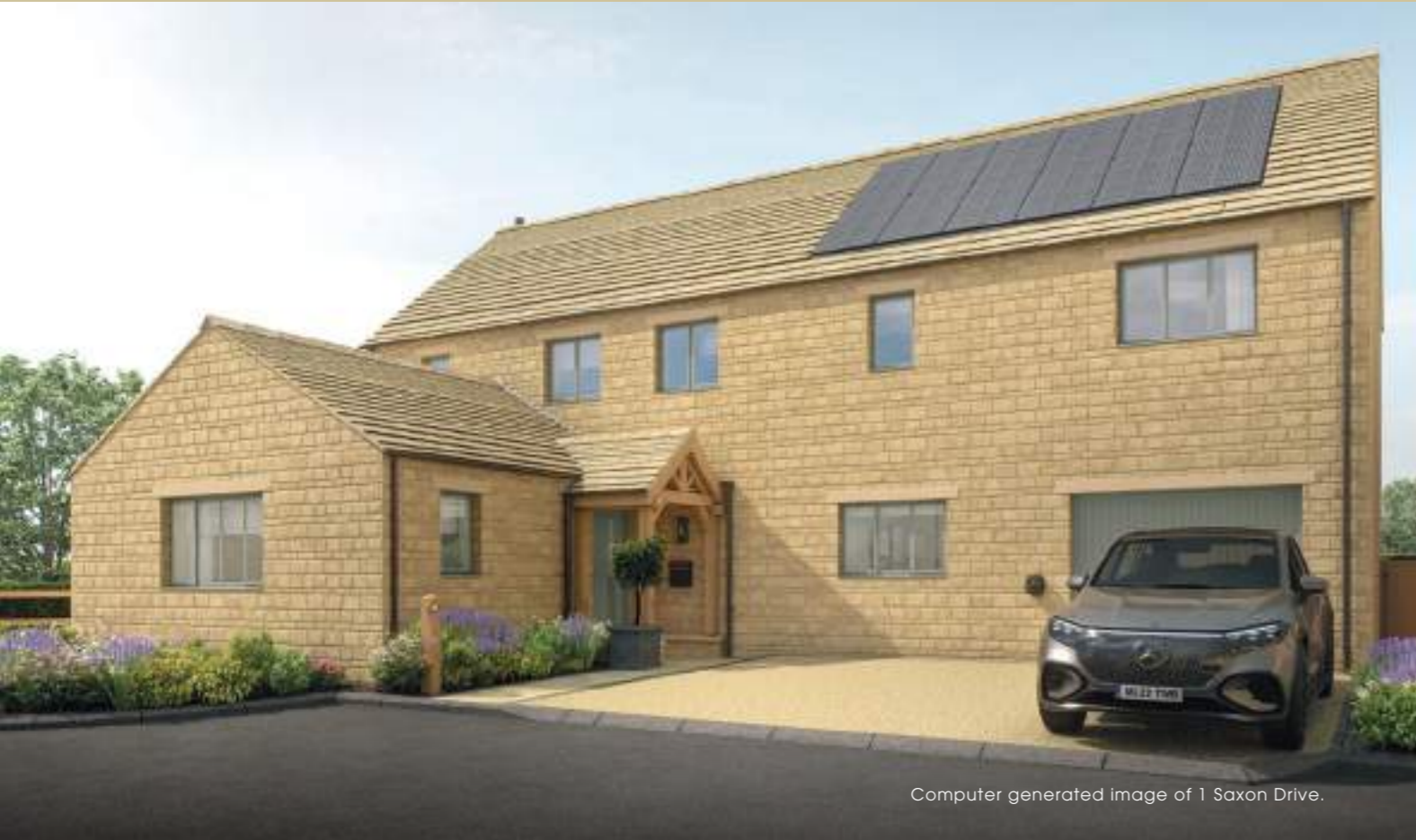
Computer generated image of 1 Saxon Drive.