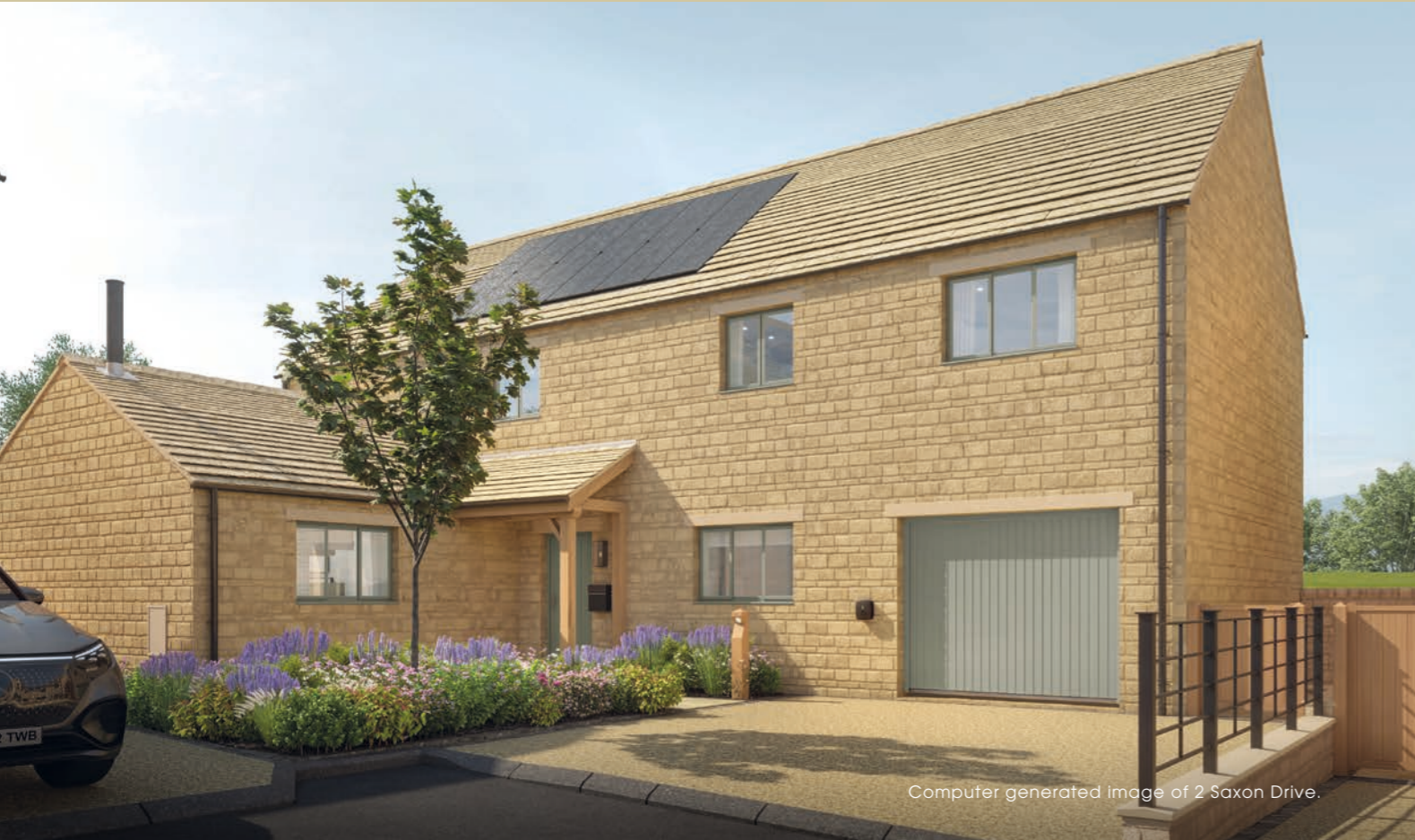
Computer generated image of 2 Saxon Drive.