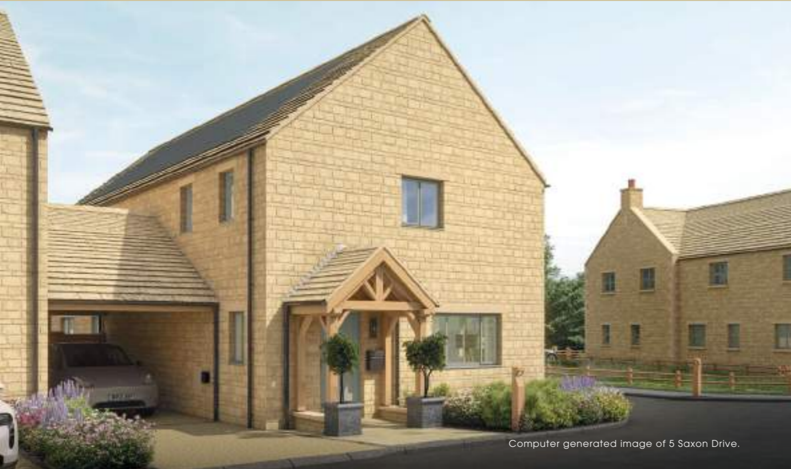
Computer generated image of 5 Saxon Drive.